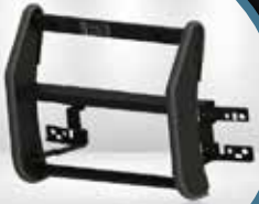
STEEL PUSH BUMPER WITH LIGHT CROSS BAR Item no. 7170-0736-01