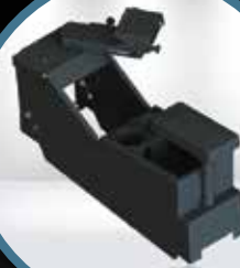
LOW-PROFILE CONSOLE BOX WITH CUP HOLDER, REAR ARMREST, AND MONGOOSE ® KIT Item no. 7170-0734-04

Ensure your fleet is taken care of from the inside out with Gamber-Johnson's full assortment of rugged and reliable vehicle products meticulously designed to fit seamlessly with the new 2020+ Ford Police Interceptor Utility.