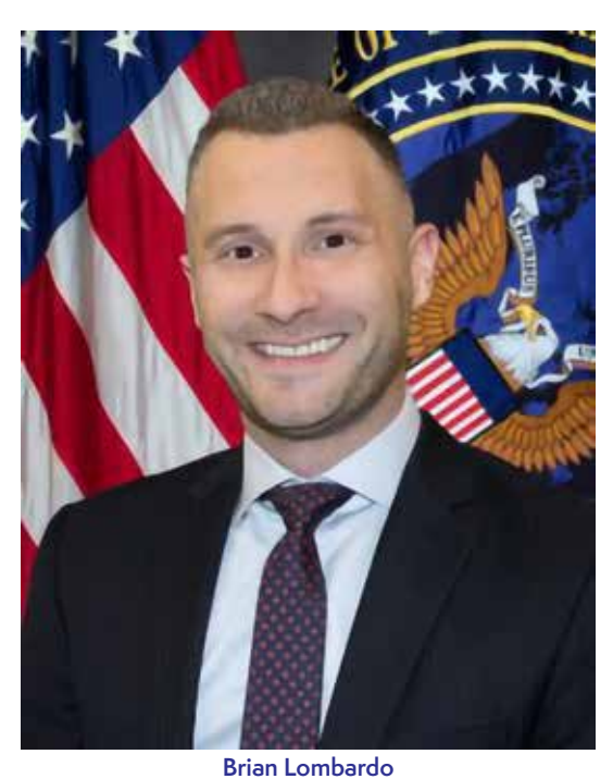
Midwest National Counterterrorism Center (NCTC) Representative